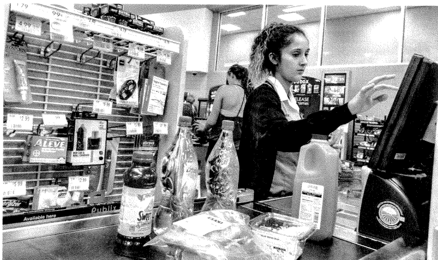
Ringing up customers at a Publix supermarket in Ft. Myers, Florida

T he federal minimum wage of $7.25 an hour has remained the same since 2009. But local governments are allowed to set a higher rate, and 29 states and the District of Columbia have done so (see map ), as well as numerous cities and counties. In April, Senate Democrats introduced a bill to gradually raise the federal minimum to $15 an hour. But many Republicans, including President Trump, oppose an increase. Two senators face off on whether raising the federal minimum wage is a good idea.