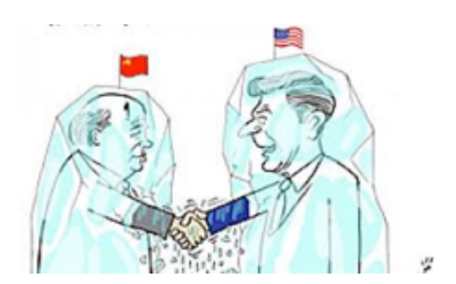
What is the topic of this cartoon? Give details: