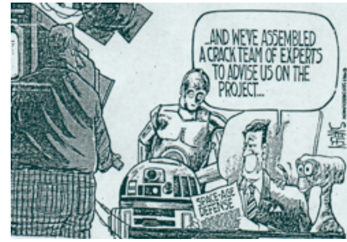
What is the topic of this cartoon?

What do you think the cartoonist saying about the idea? Why?