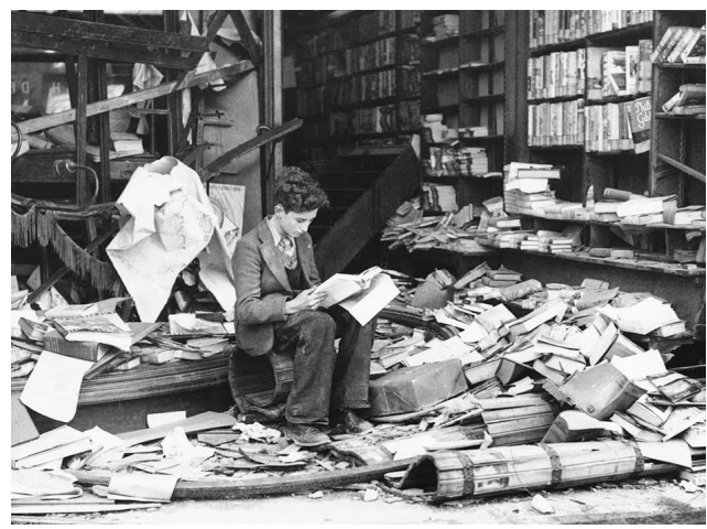
The Battle of Britain took a toll on the British people, but they never surrendered.